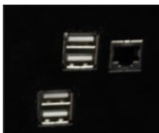
USB and network interface